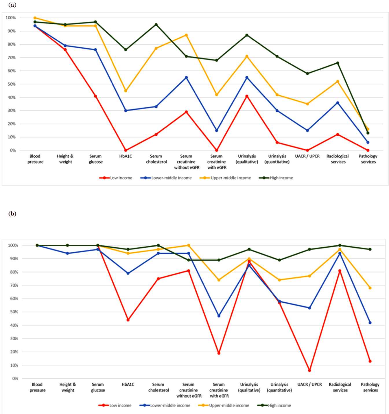
Figure 1. Health care services for identification and management of chronic kidney disease by country income level. (a) Primary care (i.e., basic health facilities at community levels [e.g., clinics, dispensaries, and small/local hospitals]). (b) Secondary/specialty care (i.e., health facilities at a level higher than primary care [e.g., clinics, hospitals, and academic centers]). eGFR, estimated glomerular filtration rate; HbA 1C, glycated hemoglobin; UACR, urine albumin-to-creatinine ratio; UPCR, urine protein-to-creatinine ratio. Data from Bello et al. 4 and Htay et al. 42